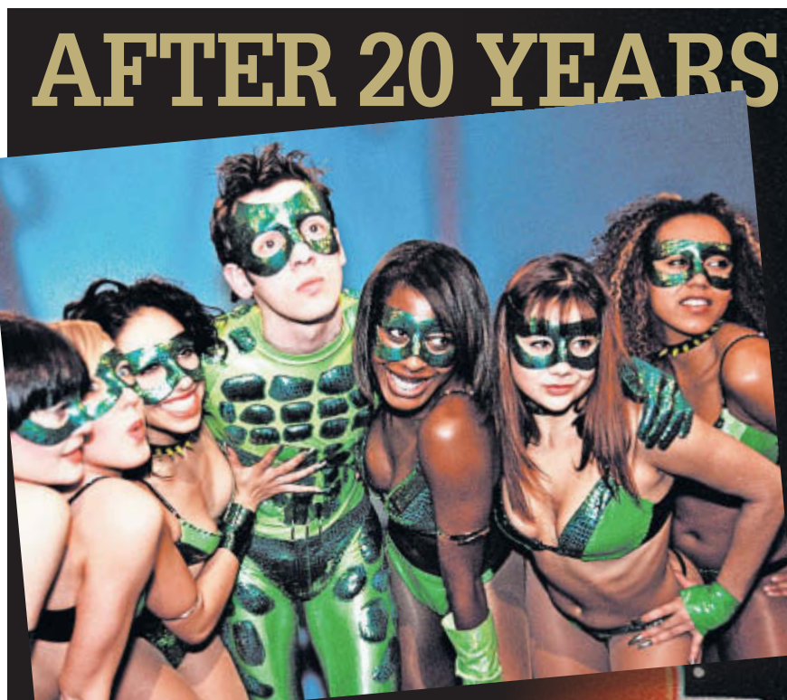
SETS SYMBOL Ralf Little as Perry "the Poison Arrow" Peter in the new mockumentary