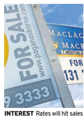
INTEREST Rates will hit sales