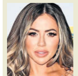
PREGNANT Holly Hagan